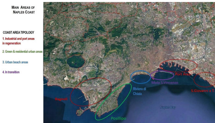
Fig. 6.1 Main areas of Naples coast

The analysis in progress started from a selection of study areas on the coast of Naples: Bagnoli-Coroglio; Posillipo, Riviera di Chiaia, Molo S. Vincenzo, Port area, San Giovanni A Teduccio (Fig. 6.1).