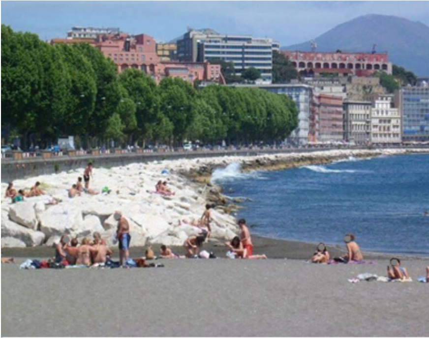
Fig. 6.2 Urban beach in Chiaia (Cosentino 2019)

activities considering the presence of the port and commercial/passenger traffic. It is evident a difficulty for population to access the sea and the beaches such as other open spaces useful for walking and relaxing. Moreover, access to the sea for recreational and leisure uses is particularly limited because of the presence of the port activities, the specific orography and often the privatisation of beaches.