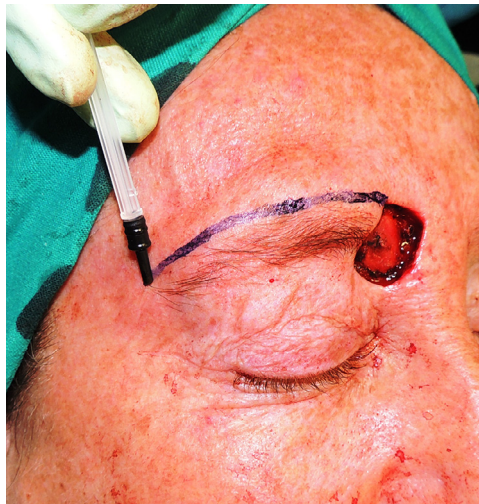
Figure 2. Intraoperative use of the syringe plunger as skin marker in flap planning.