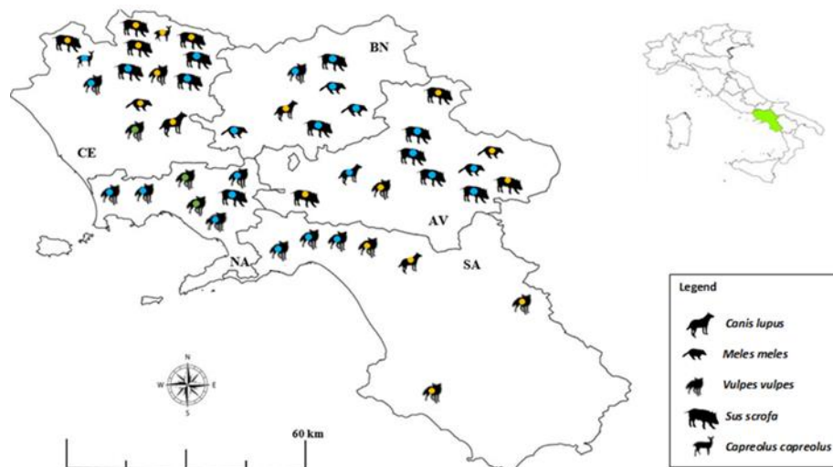
Figure 2. Map showing the distribution of synanthropic mammals ( n = 46 ) that tested positive for Toxoplasma gondii DNA in different provinces (i.e., AV, Avellino, BN, Benevento, CE, Caserta, NA, Napoli, SA, Salerno) of the Campania region, southern Italy, in 2020–2022. Green = urban area; blue = peri-urban area; yellow = rural area.

We found individuals positive to Toxoplasma gondii in all provinces of the Campania region (Figure 2), with no statistical difference between provinces ( \chi^2 = 0.73 ; p = 0.13 ).