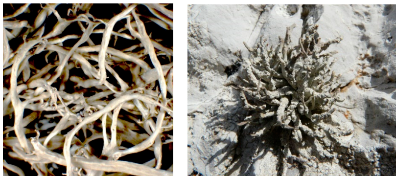
Figure 1. Ramalina implexa (left, photo P.L. Nimis, TSB 5975) and Roccella phycopsis (right, photo A. Moro).

Thus, two strictly coastal lichens, the widespread Roccella phycopsis (right, Figure 1) and the rare Ramalina implexa (left, Figure 1), were collected from rocky and sloping coasts of Lampedusa Island.