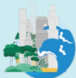
Natural and climate hazards