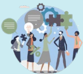
Participatory planning and governance