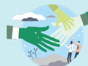
Social justice and social cohesion