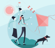
Health and well-being