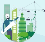
Knowledge building for sustainable urban transformation