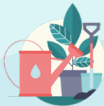
Green space management