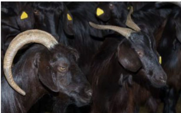
Fig. 4 Black Cilentana. From SAFE TGA. On the left, the alpine type of horns; on the right, the garganica type