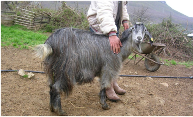
Fig. 3 Grey Cilentana. From SAFE TGA