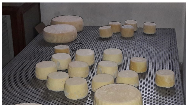
Fig. 6 Typical Cacioricotta cheese from Cilentana goat

up to about 37 °C, and then kid rennet is added. The curd is broken and then reassembled in the ‘fuscelle’, typical wicker baskets which allow the whey to drain for 24 h. The particular combination of heat and curd determines the coagulation of the milk proteins, that is the ‘cacium’ (cheese), and of the whey which becomes ricotta. The product is eaten fresh or seasoned. The ripening makes it hard, compact and crumbly. Currently, the ‘Cacioricotta del Cilento’ has been included among the Italian Traditional Agri-food Products (PAT) and is a Slow Food presidium, supported by the Cilento, Vallo di Diano and Alburni National Park (Regione Campania: Assessorato all’agricoltura, 2020, http://www.agricoltura.regione.campania.it/tipici/tradizionali/cacioricotta-cilento.htm ).