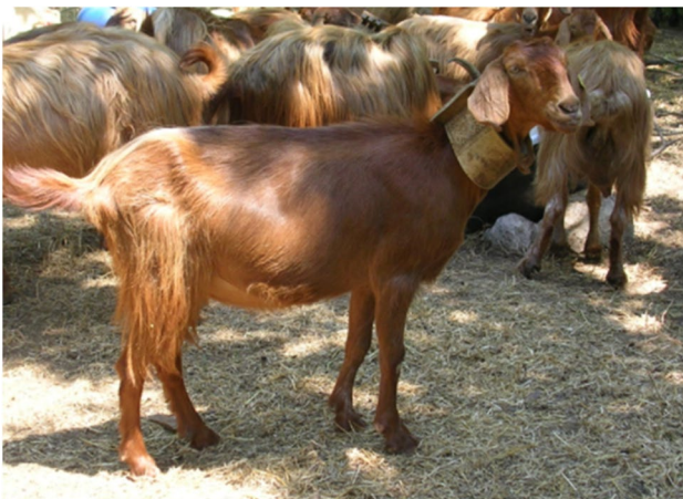
Fig. 5 Tawny Cilentana.