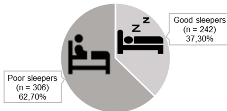
Figure 2 Percentages of poor sleepers and good sleepers during the T1 and the T2 assessments.

Notes: A Sleep Index II score >25.8 was categorized as Poor sleeper; A Sleep Index II score <25.8 was categorized as Good sleeper. The icons are selected from the https://icons8.com/icon/105962/subire-l'insonnia and https://icons8.com/icon/10787/dormire-nel-letto .